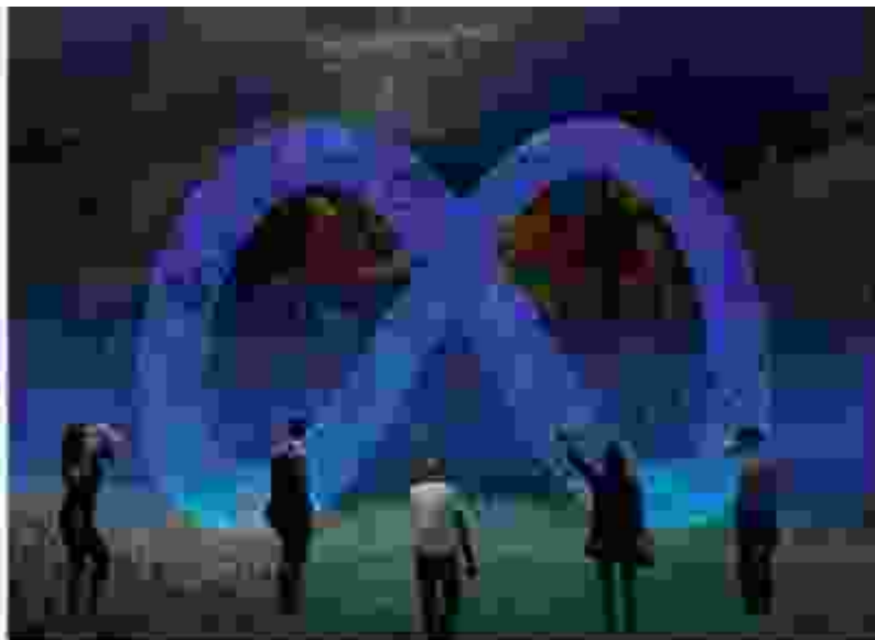
REALM OF ENDLESS POSSIBILITIES: THE METAVERSE