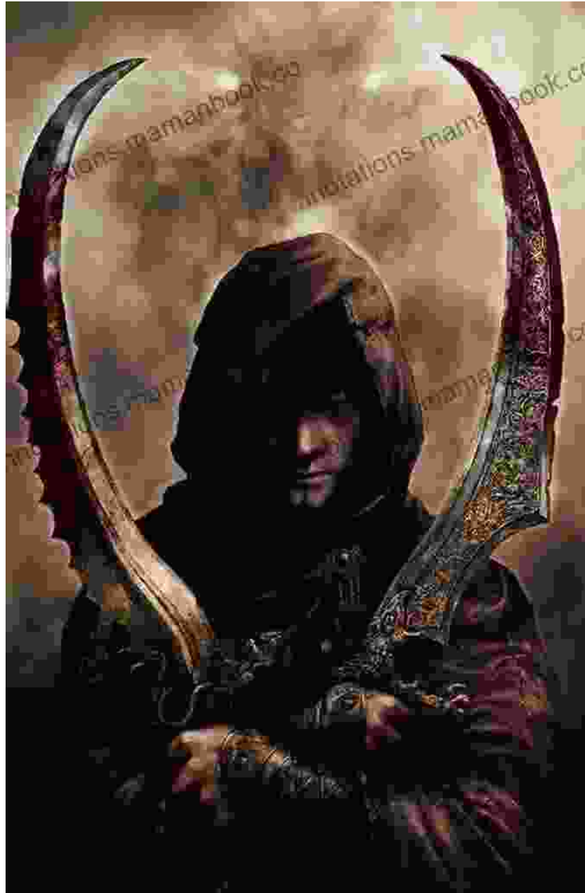
Prince Erebus, a complex and enigmatic character torn between his destiny and his own inner demons