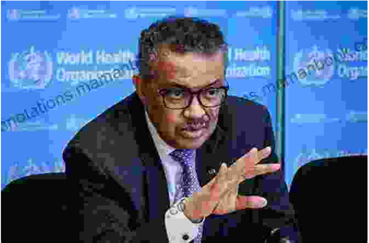
Tedros Adhanom Ghebreyesus