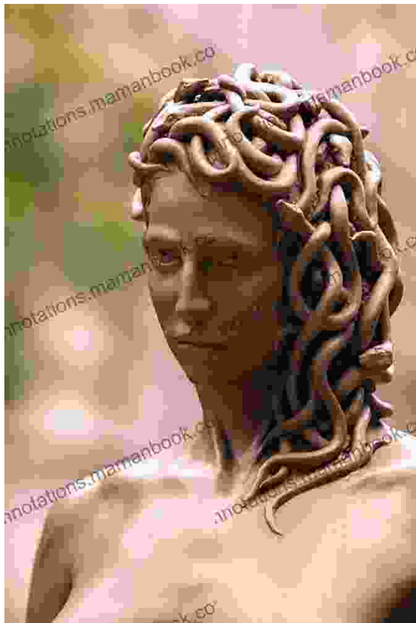
Medusa as a Symbol of Female Power, a contemporary art installation Medusa in Art and Literature

Medusa's petrifying gaze has often been interpreted as a symbol of female power and the danger associated with it. The myth can be seen as a cautionary tale against excessive pride and vanity, as well as a reminder of the consequences when social and religious norms are violated.