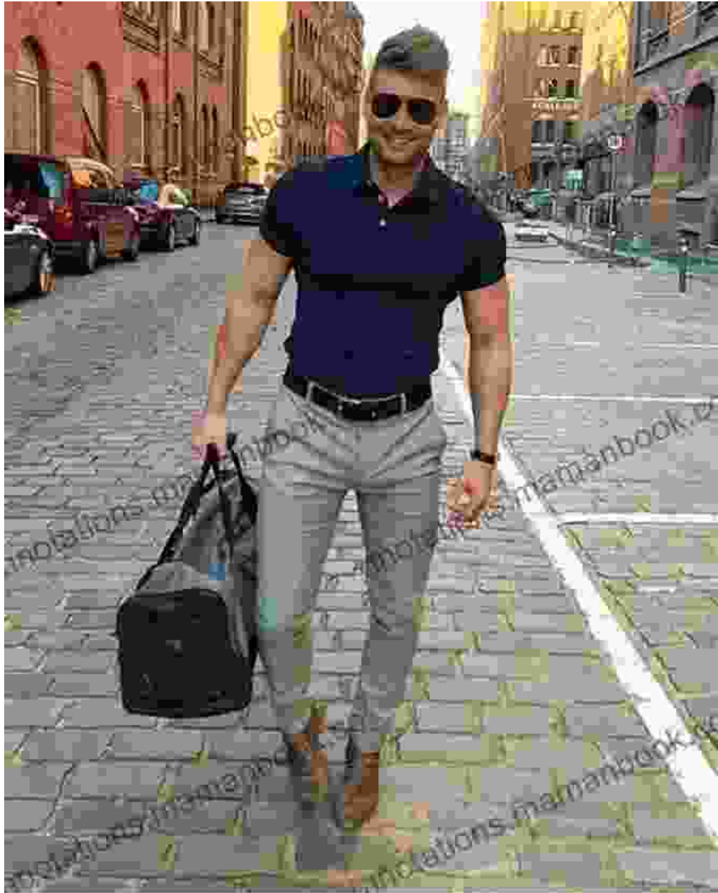
16. This casual and comfortable design is perfect for everyday wear.